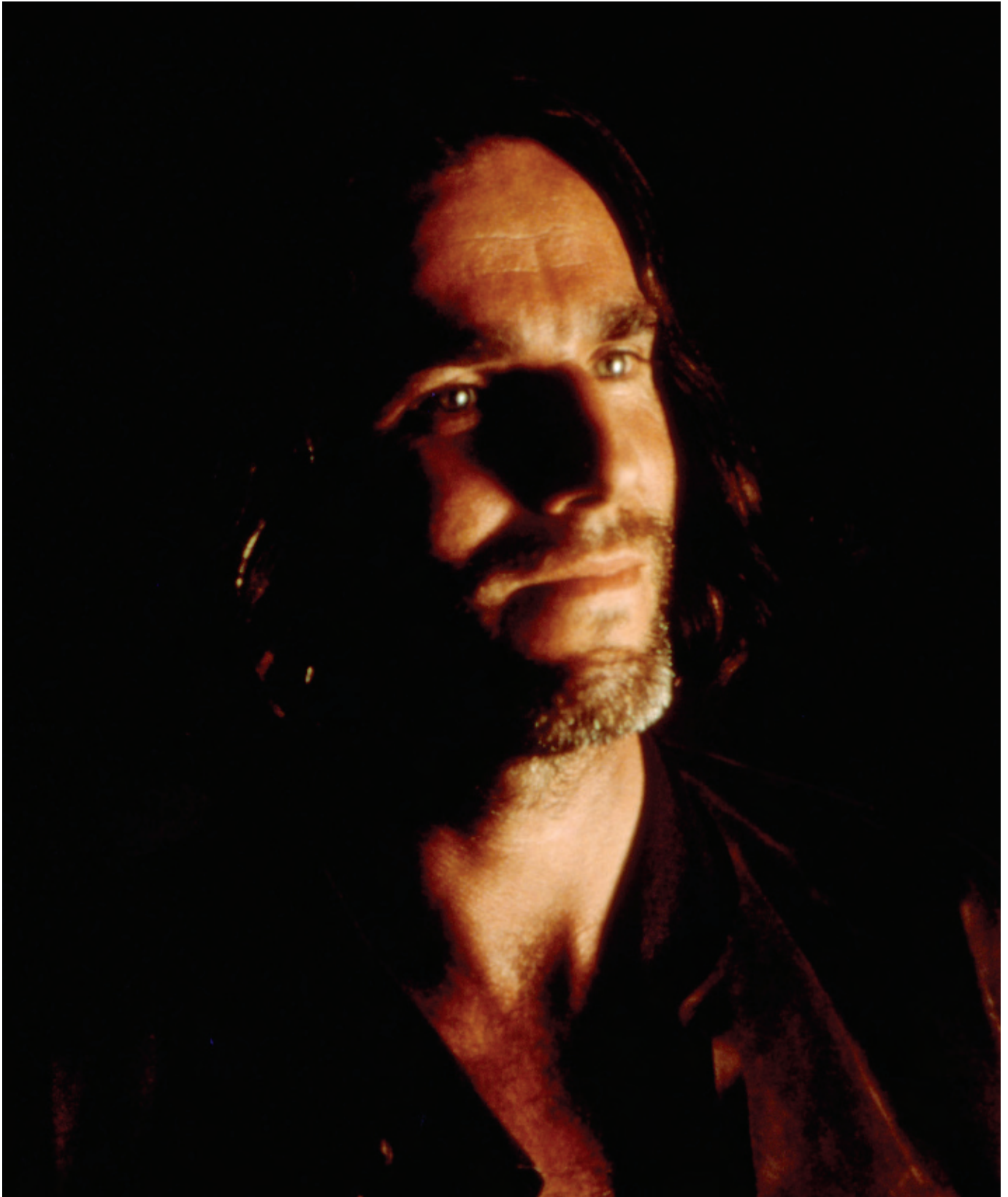
Daniel Day-Lewis as John Proctor