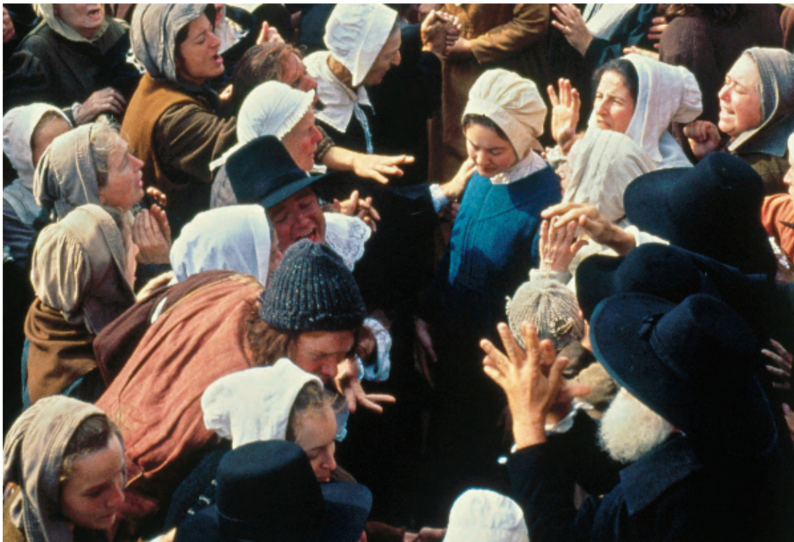
Villagers gathering to gossip

Mary Warren . I never done none of it, Abby. I only looked!