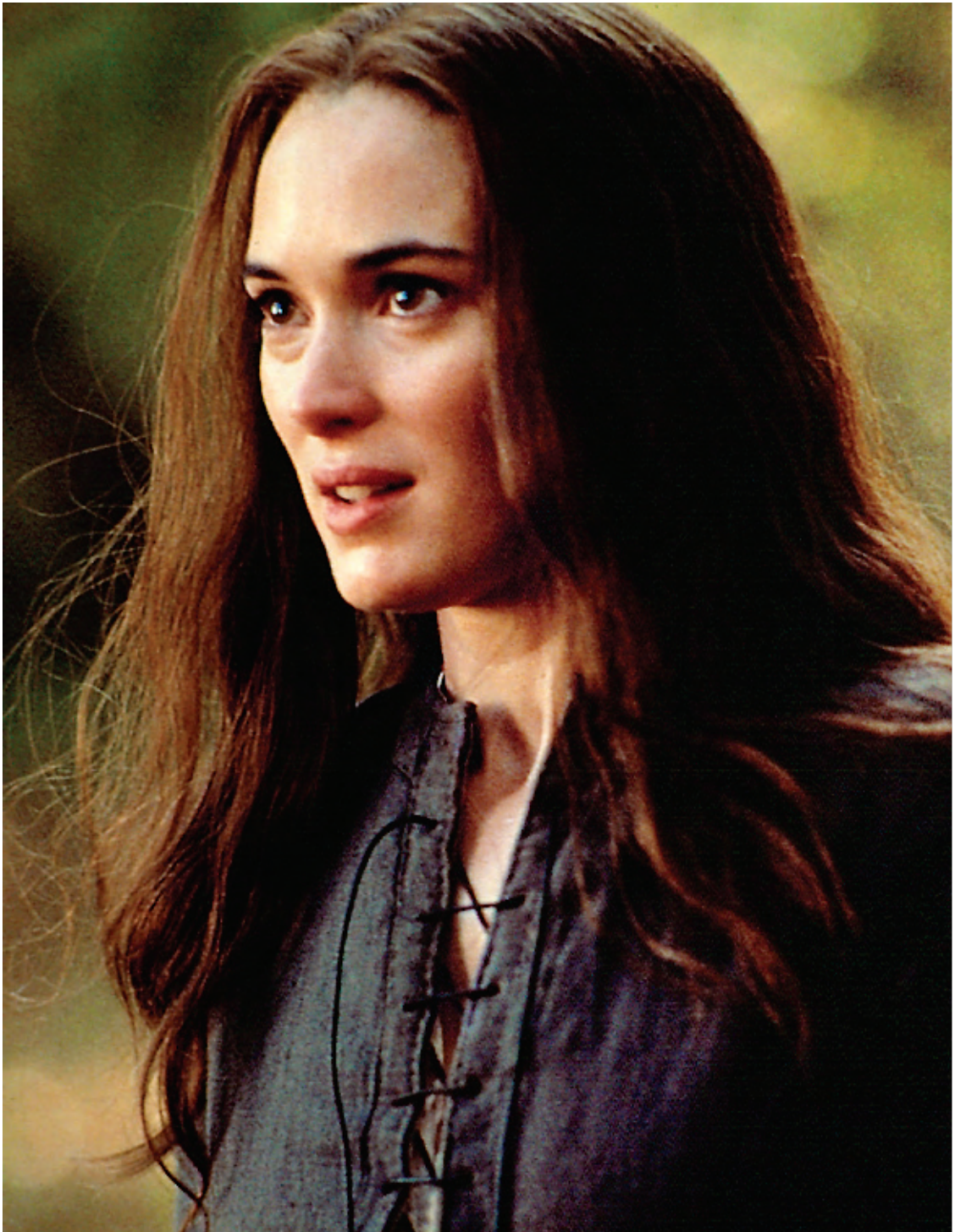
Winona Ryder as Abigail Williams